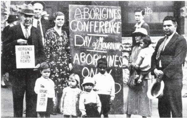
Day of Mourning | 26 January 1938