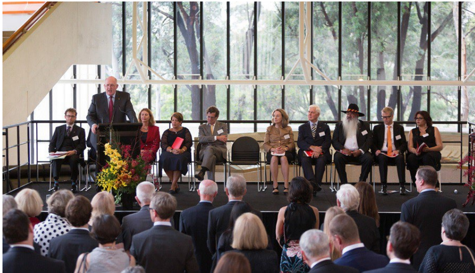
Senator Pat Dodson, Chair of Joint Standing Committee on Aboriginal and Torres Strait Islander Affairs, attends a CEFA High Court gathering with former Governors-General Sir Peter Cosgrove and General Michael Jeffery, former Chief Justice Robert French and Chief Justice Susan Kiefel

The moral, political and educative force of a 'Yes' vote of the Australian people was missing from the process.